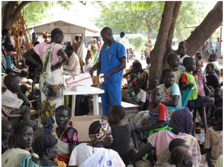
Emergency Response Team – Old Fangak, Jonglei State, October 2010

The importance of fostering the participation of local communities and a range of CSOs including women's, youth, and faith-based and church groups in the development of South Sudan cannot be overstated. Community participation enhances the relevance and sustainability of development initiatives; while a strong civil society facilitates good governance by increasing the likelihood of local authorities being held accountable to the people.