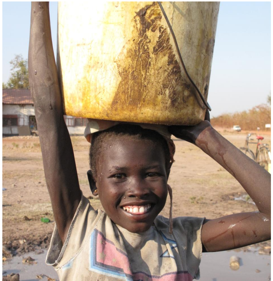
Girl getting water in Rumbek, 2010.

This report presents the views of 38 aid agencies working on peace-building, development, and humanitarian assistance in South Sudan.