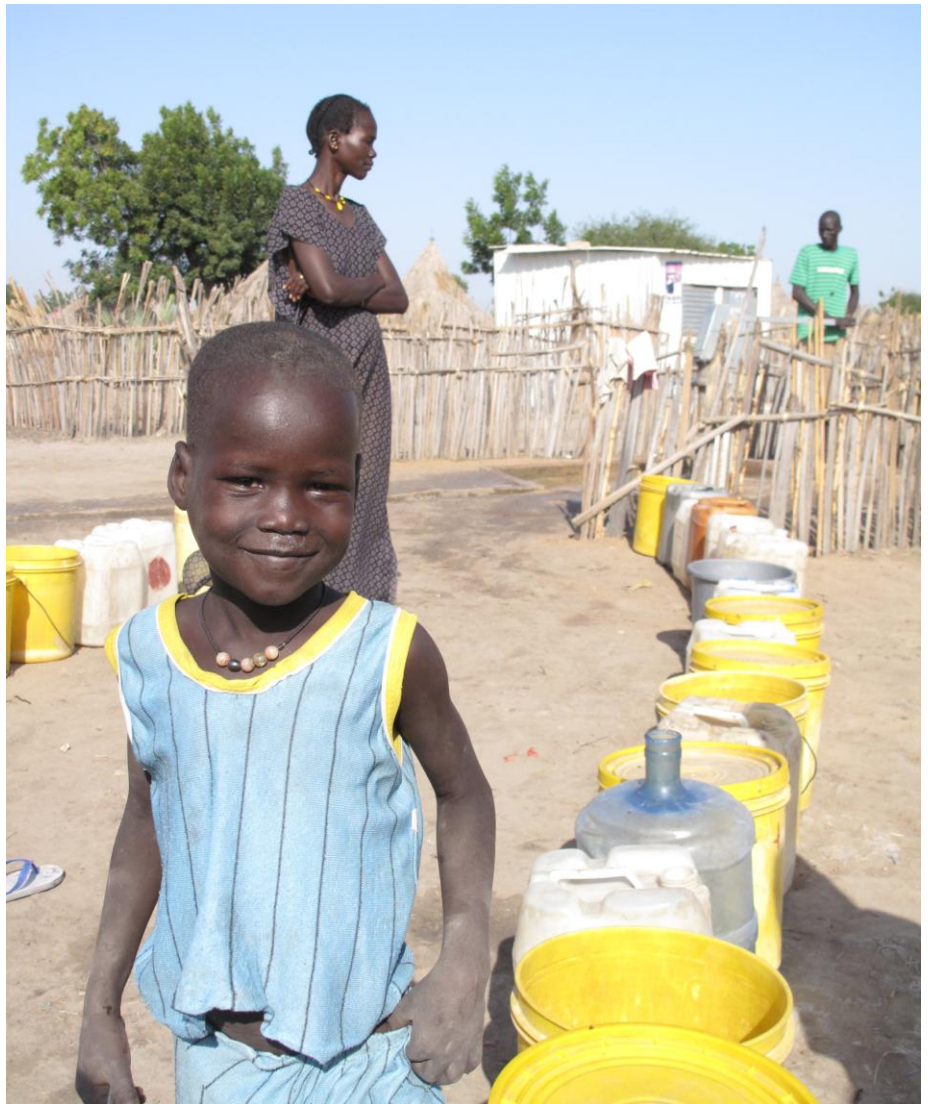
Girl at repaired borehole, Leer Town.

South Sudanese live in an environment in which livelihoods are constantly under threat: by climatic shocks, by conflict, and by a fluctuating global economy. Income shocks over the past year have been particularly harsh, and more than three million people throughout the country are either moderately or severely food insecure. 30