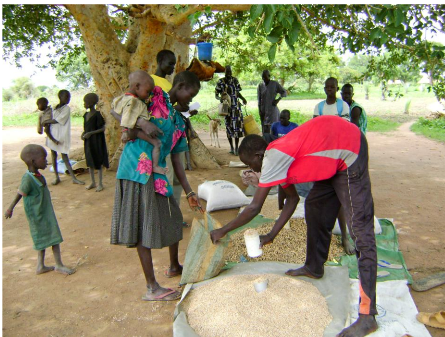
A woman receives local seeds of her choice in Warrap State, South Sudan. World Vision distributes seed coupons to help the community's poorest people buy seeds of their choice locally.

Throughout the CPA interim period, humanitarian and development assistance in South Sudan has in large part consisted of single sector interventions, in many cases focused on the symptoms of a problem rather than addressing what is almost always a multiplicity of underlying causes. This is perhaps attributable to the multitude of challenges and complexities that have been described throughout this paper: an ever-changing context that fails to sit neatly in a humanitarian, recovery or development box; an enormously challenging operating environment; and the difficulty of understanding the drivers and dynamics of the conflict.